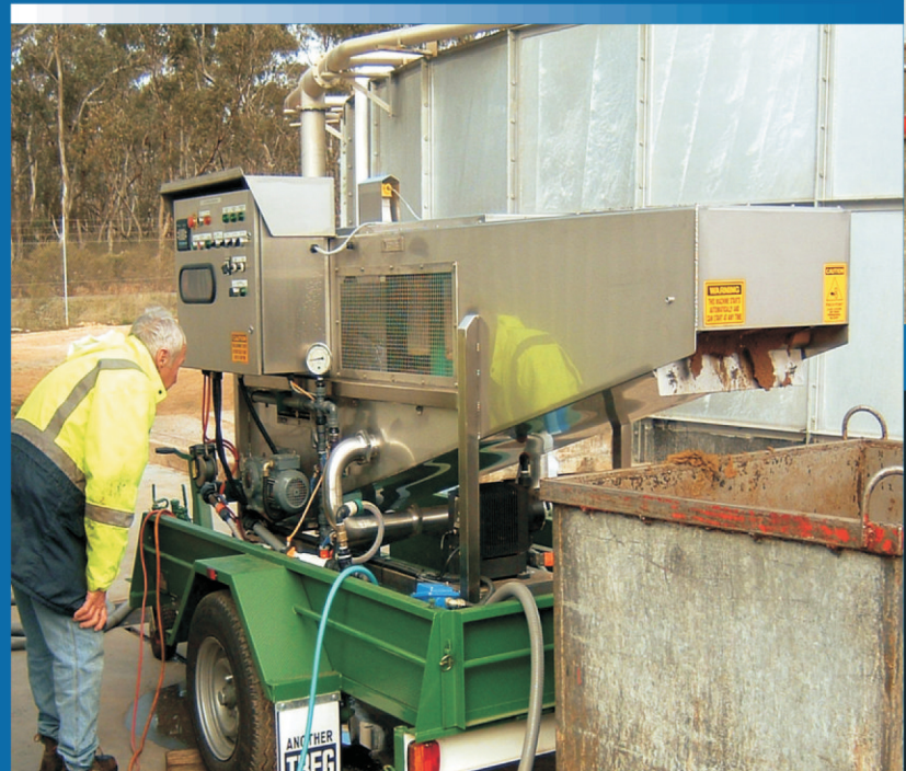
Mobile dewatering packages are available