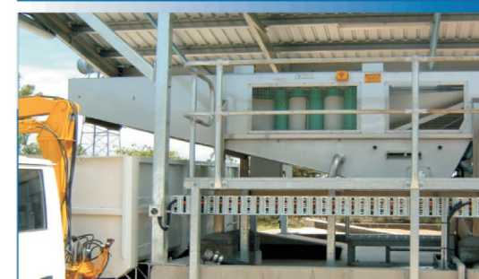
Built to last with 316 stainless steel frame.