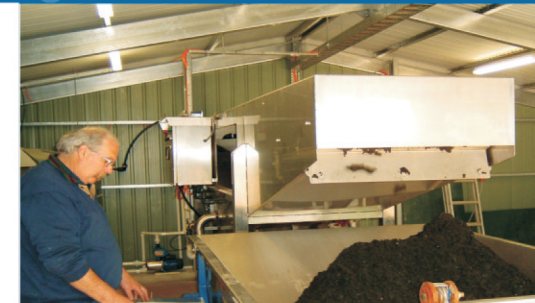
Simple to install, maintain and operate.

Initial dewatering is by gravity draining in the feed cavity. Sludge is then trapped between the sides of the belt and squeezed as it passes around a series of vertical rollers where pressure and shear form a filter cake.